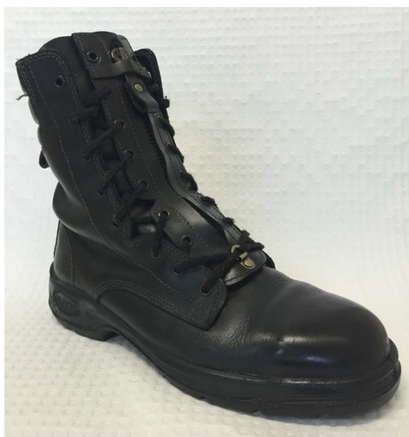
Fig. 3 Oliver Footwear Pty Ltd Structural Fire Fighter Boot (Model Number:20292)

Once all baseline measures have been taken, a therapist (separate investigator) located in an adjacent room (with no view of the participants) will allocate participants to one of the two groups (using the allocation system outlined in the manuscript). The therapist will fit and heat the allocated insoles into the participant's footwear. Once the insoles have been heated, the therapist will place the participant's footwear on a table outside of their room for the blinded assessor. The assessors, unaware of the insole allocation, will collect the participant's footwear and advise the participants to wear their footwear for several minutes to allow moulding. Following this, participants will be asked to rate the comfort of their shoes after a brief period of wear (see the 'outcome measures' section for more detail). In addition, all participants will be issued with: (i) an information sheet informing them of the recommended wearing-in protocol and how to care for their shoe insoles, and (ii) an individual diary for participants to self-report pain levels over the 11 weeks of basic training. The self-report